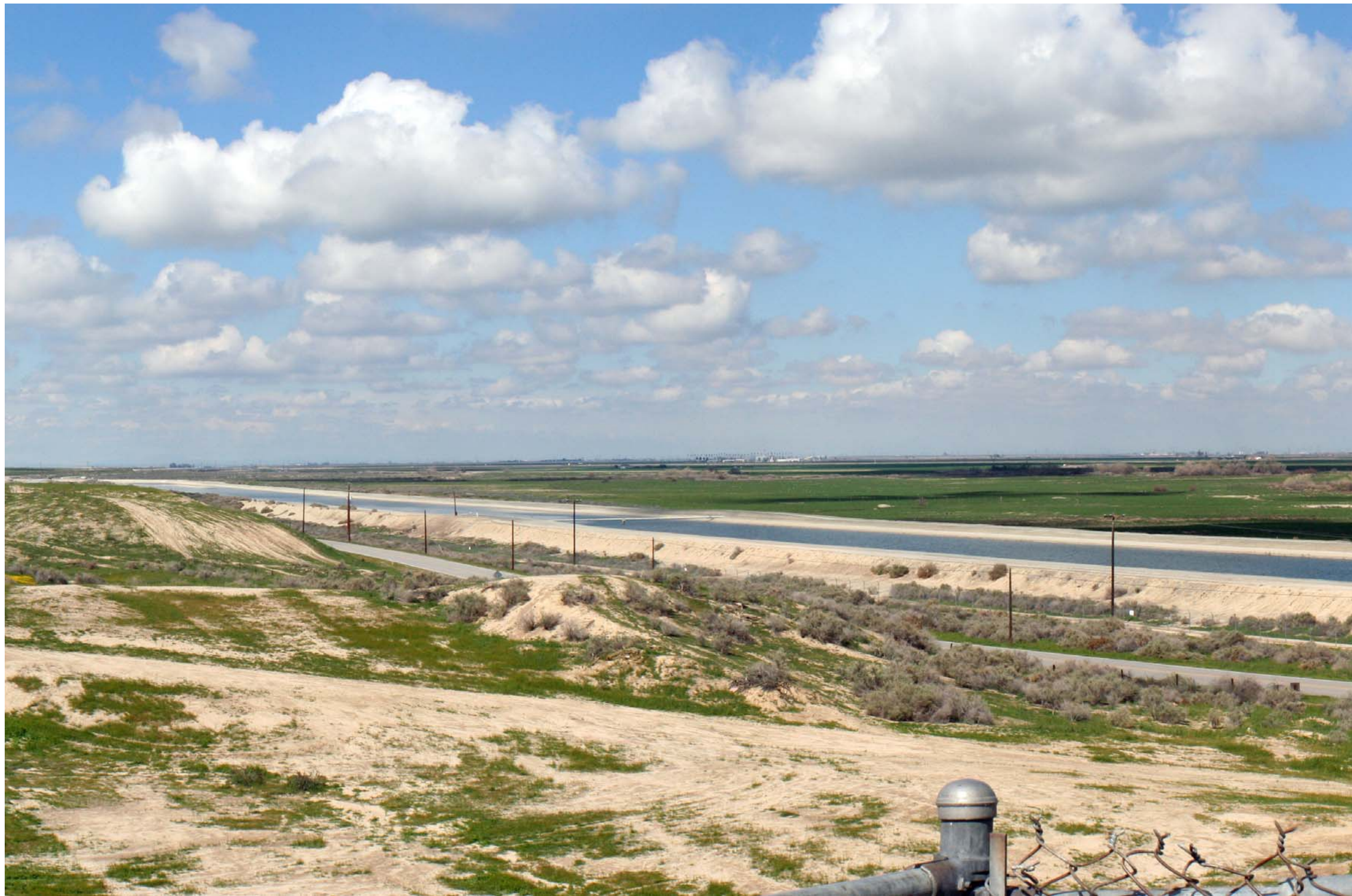
Photograph is intended to be viewed 10 inches from viewer's eyes when printed on 11x17 paper. The photograph below has been cropped top and bottom to show a wide angle of view with the above photograph's area shown in yellow.

P:\ENV\PLANNING\Hydrogen Energy International LLC\HECA\Sims\layouts\heca layouts.incd