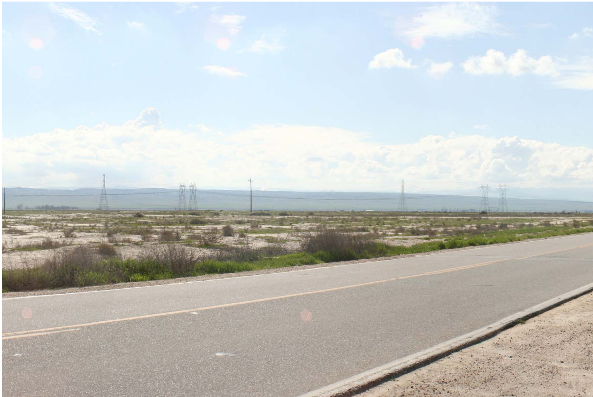
Photograph is intended to be viewed 10 inches from viewer's eyes when printed on 11x17 paper. The photograph below has been cropped top and bottom to show a wide angle of view with the above photograph's area shown in yellow.

P:\ENV\PLANNING\Hydrogen Energy International LLC\HECA\Sims\layouts\heca_layouts.incd