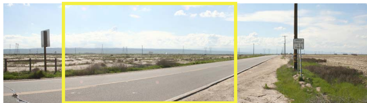
Photograph is intended to be viewed 10 inches from viewer's eyes when printed on 11x17 paper. The photograph below has been cropped top and bottom to show a wide angle of view with the above photograph's area shown in yellow.

P:\ENV\PLANNING\Hydrogen Energy International LLC\HECA\Sims\layouts\heca layouts.incd